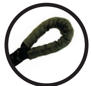
Spliced Eye (S.E)