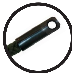
Marlow Multifit Termination (M.F.T) (NSN coded as per table shown)