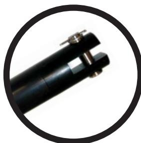
Marlow Standard Conical Termination (S.C.T)